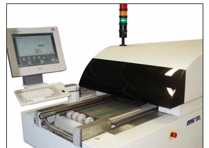
Pin Chain/Mesh Belt conveyor.

450mm Stainless steel mesh belt conveyor or (optional) combination Pin Chain/Mesh Belt conveyor, width 50-330mm adjustable by hand wheel or motor (optional), SMEMA interface.