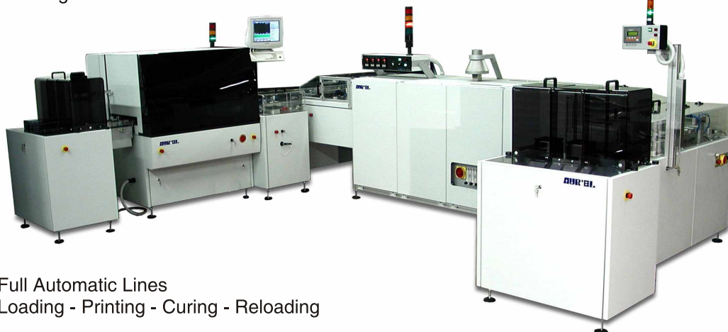
Full Automatic Lines Loading - Printing - Curing - Reloading